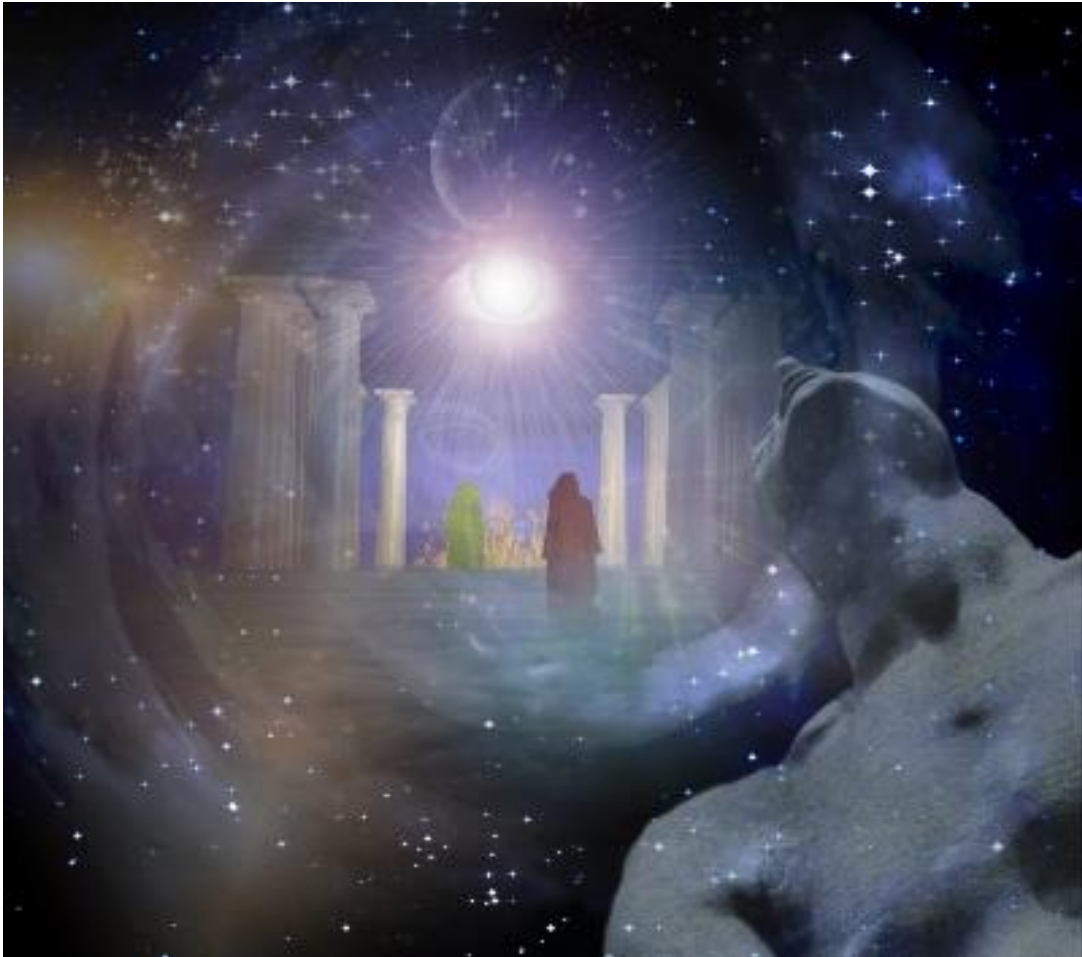
Figure 1: The Astral Dimensions